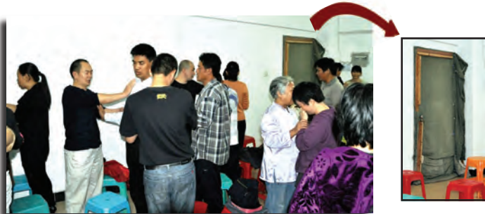
A secret meeting of the house church. Notice the door to the meeting room is soundproofed for security purposes.

In 16 years of ministry, we have been fortunate and successful at keeping the work hidden and the churches safe. During that time, we have been followed, questioned and secretly photographed by police. We have been detained for hours at a time having all our materials confiscated. At the Holy Spirit's prompting we have canceled meetings and made hasty departures from cities. We limit our time in any given city to no more than four days. In some places we stay for only a few hours.